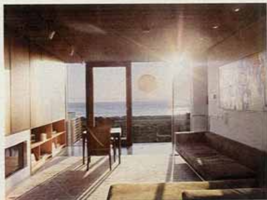
ABOVE: ON THE ADDITION'S THIRD FLOOR, THE FAMILY ROOM HAS AN OCEAN VIEW. RIGHT: A VIEW FROM THE GARDEN, THROUGH THE OPEN SLIDING DOORS, INTO THE FIRST-FLOOR REC ROOM, WITH ITS RACK OF SURFBOARDS. AT THE FRONT OF THE HOUSE, A WOOD-SLAT FENCE AND CYPRESS TREES SCREEN THE ROOM FROM THE STREET. THE TRAVERTINE-TOPPED COFFEE TABLE AND CHEST OF DRAWERS WERE DESIGNED BY ERNEST BORN FOR THE EXISTING '50S HOUSE. THE SOFA BY JENS RISOM WAS ALSO PART OF THE HOUSE'S ORIGINAL FURNISHINGS.