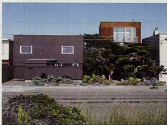
ABOVE: THE HOUSE AND ADDITION SEEN FROM THE STREET. BELOW: SUNLIGHT AND TREES CREATES DEEP SHADOWS ON THE GLASS BRIDGE. OPPOSITE: IN THE ORIGINAL HOUSE, THE LIVING ROOM'S ARCHITECTURE, INCLUDING THE LOW BENCH AT THE WINDOW AND THE WOOD-SLAT WALL SYSTEM FOR HANGING ART, WAS INTACT. THE DESIGNER STEVEN MILLER USED BOTH VINTAGE AND REPRODUCTION MIDCENTURY MODERN FURNISHINGS FOR THE ROOM. AS WELL AS LUCITE SHELVES OF HIS OWN DESIGN. THE ORANGE NEOPRENE COVERING ON THE CARLO MOLINO CHAIR IS A SLY REFERENCE TO THE OWNER'S LOVE OF SURFING.